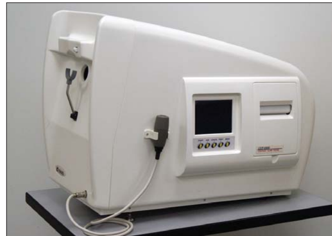
Figure 1. The Takagi Contrast Glare Tester CGT-1000.

The Takagi CGT-1000 is a self-contained unit for the measurement of CS with and without the presence of glare (Fig 1). Contrast sensitivity is measured at six target sizes: 6.3^\circ , 4.0^\circ , 2.5^\circ , 1.6^\circ , 1.0^\circ , and 0.7^\circ . There are 13 contrast levels (0.01 to 0.64 contrast or 2.00 to 0.34 \log_{10} \text{CS} ) with an average step size of 0.15 \log_{10} \text{CS} . The stimulus is a dark ring on a light background and has duration of either 0.2, 0.4, or 0.6 seconds, with an interval of 1, 2, or 3 seconds between presentations